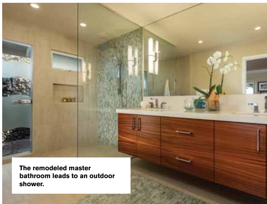
The remodeled master bathroom leads to an outdoor shower.

in Waikoloa. When Diane introduced Rene to the couple, they immediately appreciated his straightforward, detail-oriented approach.