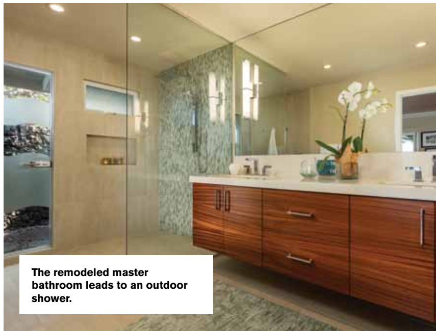
The remodeled master bathroom leads to an outdoor shower.

in Waikoloa. When Diane introduced Rene to the couple, they immediately appreciated his straightforward, detail-oriented approach.