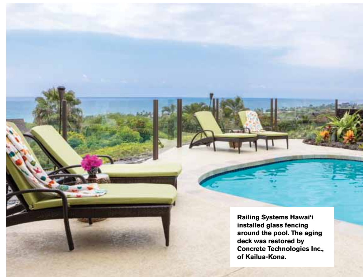
Railing Systems Hawai'i installed glass fencing around the pool. The aging deck was restored by Concrete Technologies Inc., of Kailua-Kona.

According to Hanna, the house had previously been a mishmash of tile, fake bamboo laminate floors and linoleum. Now the home features handsome cumuru wood floors, sourced from