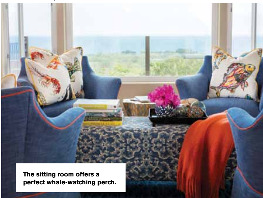
The sitting room offers a perfect whale-watching perch.