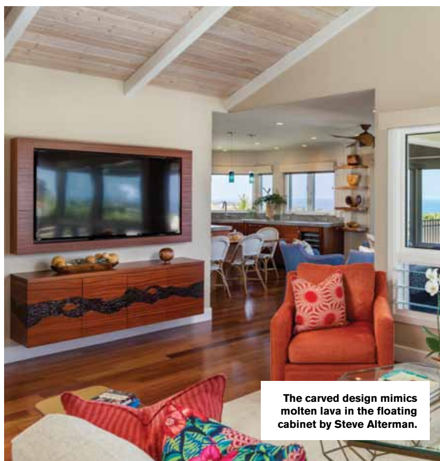
The carved design mimics molten lava in the floating cabinet by Steve Alterman.