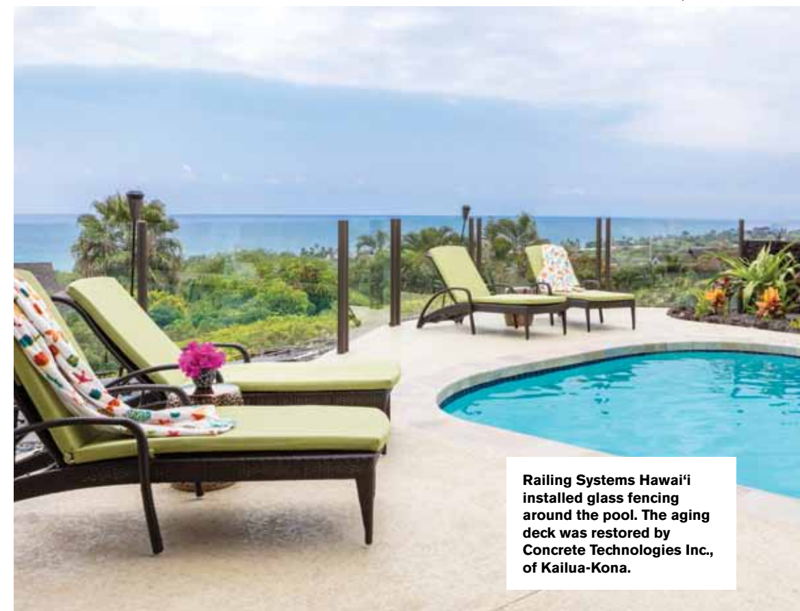
Railing Systems Hawai'i installed glass fencing around the pool. The aging deck was restored by Concrete Technologies Inc., of Kailua-Kona.